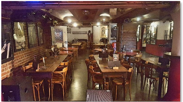
view from stage to the left