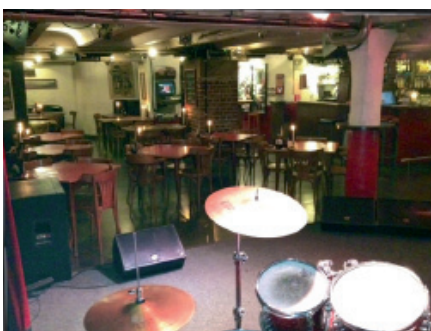
View from the stage to the left