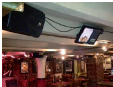
Delay-Line (c 1 )