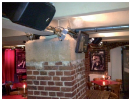
Delay-Line (c 2 )