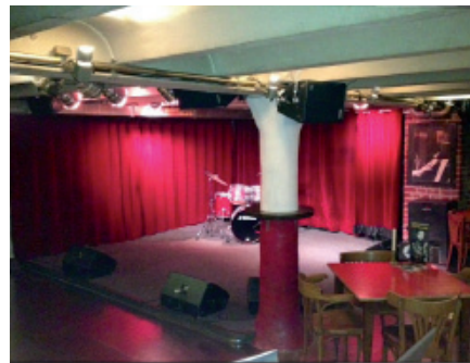
Stage & PA-Setup