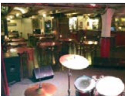
View from the stage to the left