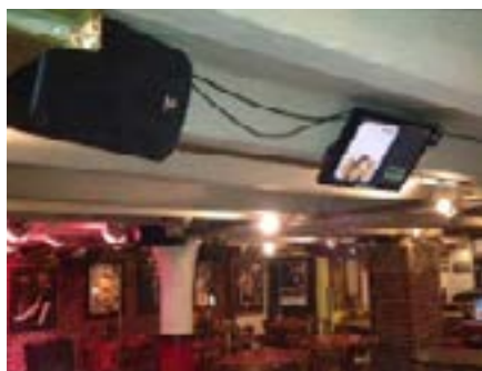
Delay-Line (c 1 )