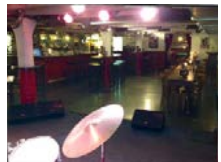
View from the stage to the right