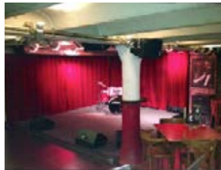
Stage & PA-Setup