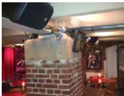
Delay-Line (c 2 )